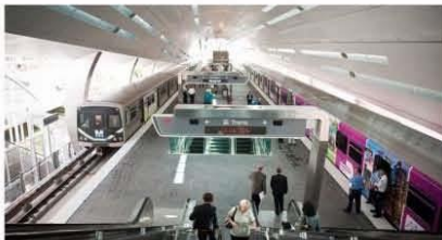
METRO STOP LOCATED ACROSS STREET