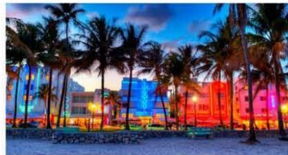
SOUTH BEACH: 13 MILES