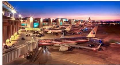
MIAMI INTERNATIONAL AIRPORT: 7 MILES