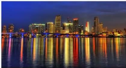
DOWNTOWN MIAMI: 7 MILES